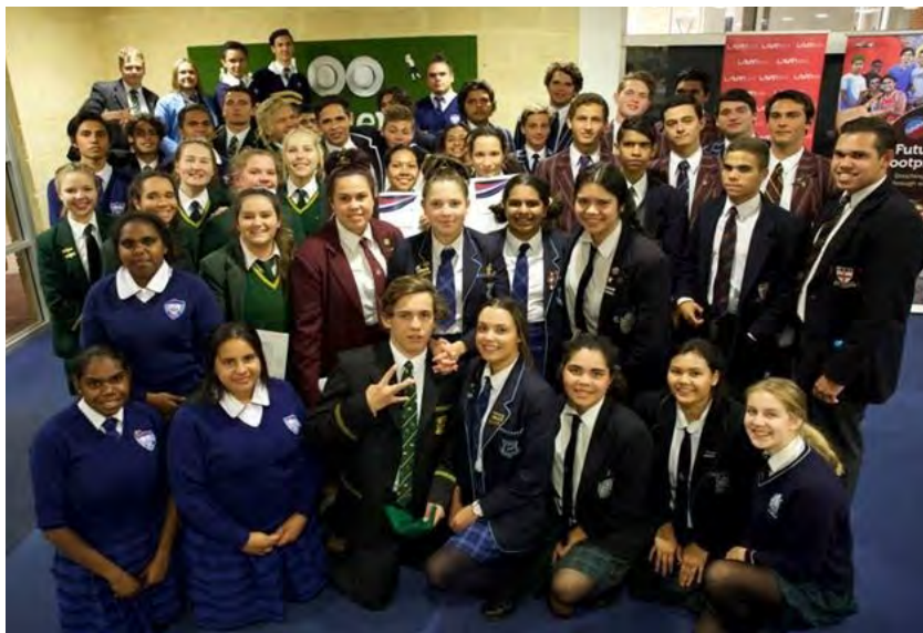
Graduating students 2015