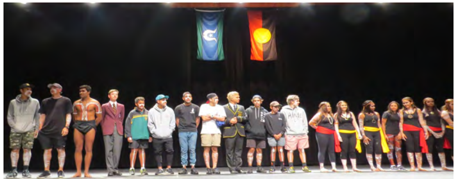
Scotch College NAIDOC performance at the Yira Yarkiny Concert