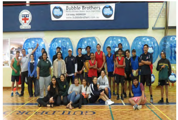
Playing Bubble Soccer at the Student Council meeting.

There were some great topics discussed that night and many wonderful ideas which hopefully we can use in the future.