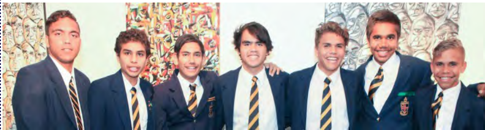
Christ Church Grammar students at their NAIDOC art exhibition. Right: Guildford Grammar NAIDOC dancing.

I can't wait for next years theme and to see what we will do!