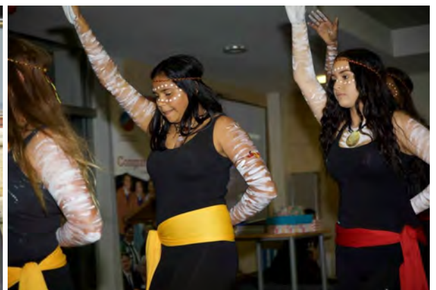
Presbyterian Ladies College dance group Gorna Liyarn, performing at the Graduation