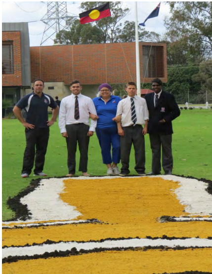
Guildford Grammar School NAIDOC ceremony