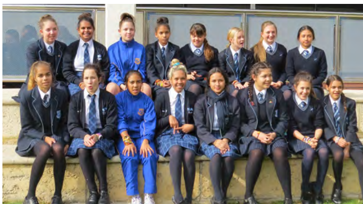
Iona Presentation College students