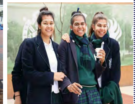
Presbyterian Ladies College students