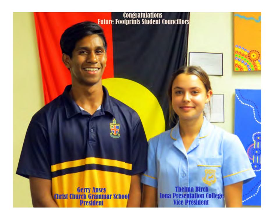
President & V/President of Student Council 2015