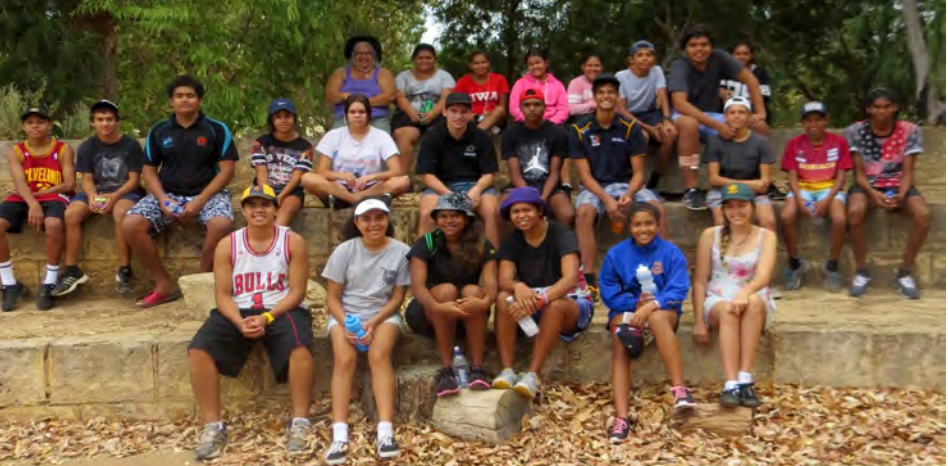
Future Footprints students at the Fairbridge Camp March 2015